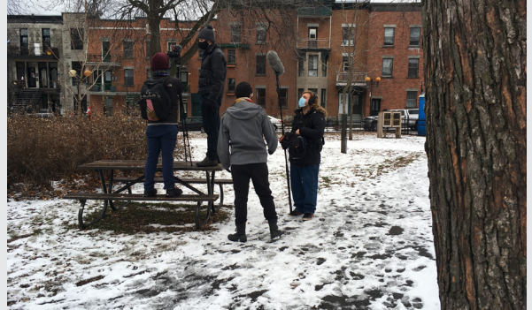
© Image from the documentary video workshops, December 2020