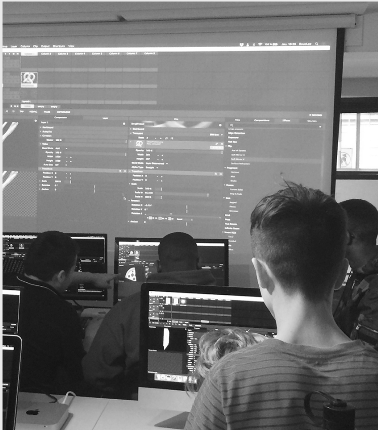
VJing workshop with Le Beau Voyage, 2019

4,666 PARTICIPANTS IN PROGRAMMING ACTIVITIES